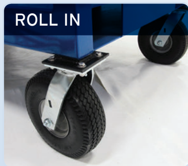
ROLL IN Large, foam-filled flat-free wheels make locating these units a breeze.