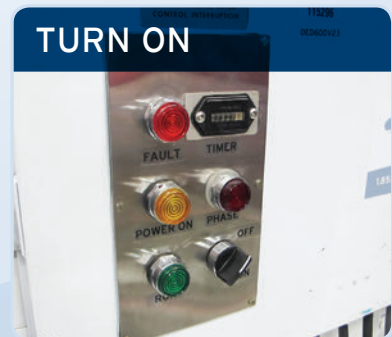
TURN ON This simple selector switch gives you ON/OFF control. Can't be any simpler than that.

We also rent industrial and portable air conditioning units, chillers, and industrial strength heating units. Visit www.cool-air.com for our full line of rental equipment.