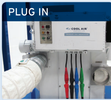
PLUG IN The warm, very humid re-activation air needs to be vented out of the space.