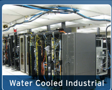
Water Cooled Industrial

This server room required a temporary cooling system while a new system was being installed. We were contracted to provide 15 tons of temporary cooling capacity. This unit held the space at the set point continuously for the 8-week duration of the project.