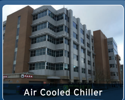
Air Cooled Chiller

This server room required a temporary cooling system while a new system was being installed. We were contracted to provide 15 tons of temporary cooling capacity. This unit held the space at the set point continuously for the 8-week duration of the project.