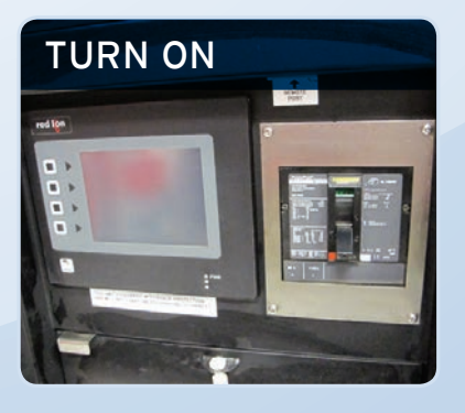
Easy to follow touch screen controls allow you to tailor make how you operate this unit.

We also rent portable air conditioning units, fans, air movers, and industrial strength heating units. Visit www.cool-air.com for our full line of rental equipment.