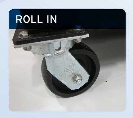
Heavy duty casters and good mobility make locating these units a breeze. Wheel assemblies are removable for forklift or crane placement.