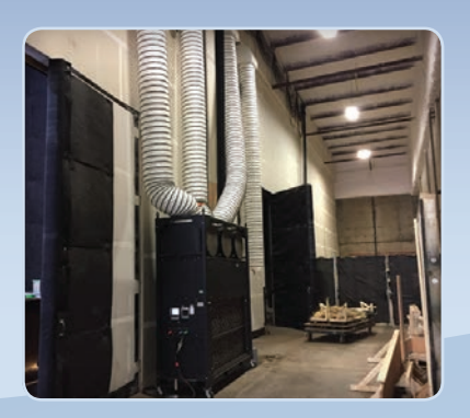
This unit sat right outside this film set with the cold air ducted in via a custom ventilation system, guaranteeing none of the equipment was in the background when they were shooting.