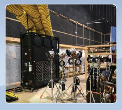
The powerful fan in this unit allowed this production to conveniently locate it far out of the way, while long runs of duct carried the cool air directly where it was needed.