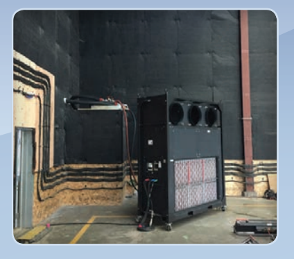
Placed inside a film stage with multiple setpieces used at different times in the day, this air handler unit is ready to supply spot-cooling to specific areas as needed.