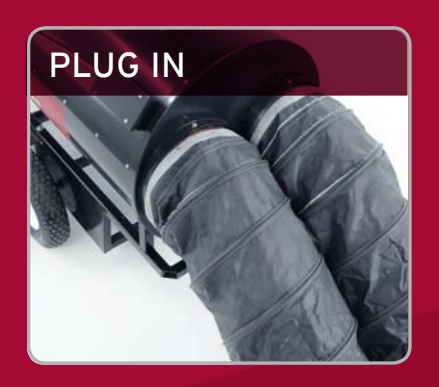
High heat insulated duct with pin lock connections can be easily coupled to customize any installation.