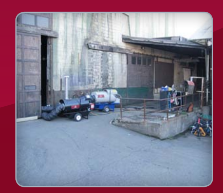
Film industry ready, these units delivered the warm air into this warehouse while the exhaust gases were vented straight from the machine located outdoors.