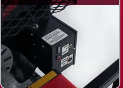
A selective toggle allows you to go from on/off control to a wired remote thermostat.