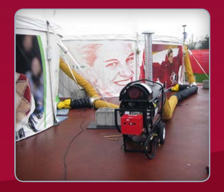
These promotional Olympic tents were kept dry and comfortable because of this gas fired heater. The separate pods of this structure required individual duct runs.