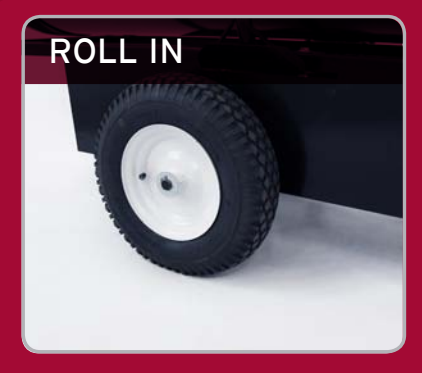
Large air-filled tires and balanced construction allow this large unit to be wheeled with relative ease.