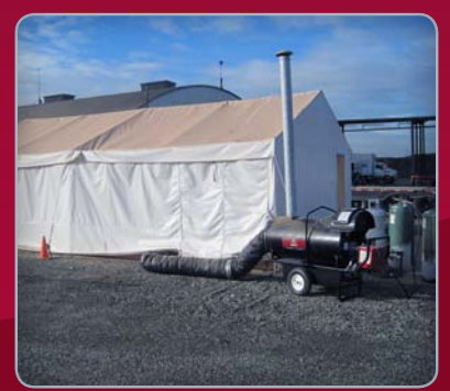
This unit surpassed expectations when it came to heating this temporary structure. Dependable service and reliable equipment are a must when dealing with special events.